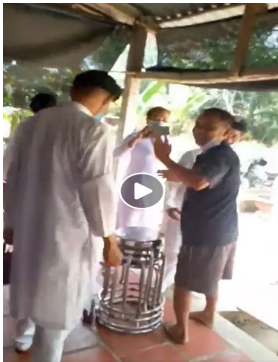
One of the 1997 sect members disrupting the ritual of authentic Cao Dai adherents (in white religious garments) on 10 January 2022